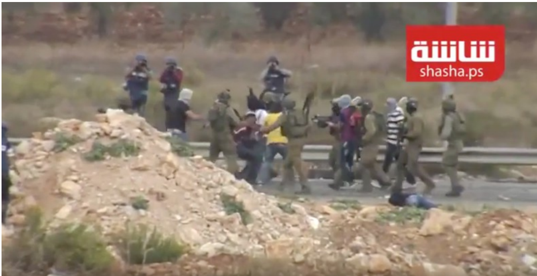
Another video still shows the man in the striped shirt working closely with Israeli soldiers.

The same man appears even more clearly in the video at the top of this post. It shows the soldiers and their undercover agents, including the man in the striped shirt tackling, kicking and dragging away Palestinians. Several of the agents also appear to be armed with small pistols.