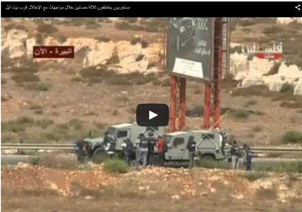
It is titled "Mustarabin kidnap three injured persons during confrontations with the occupation near Beit El."

This 11-minute video posted by Wattan TV shows the Israeli undercover agents working side by side with uniformed Israeli occupation forces.