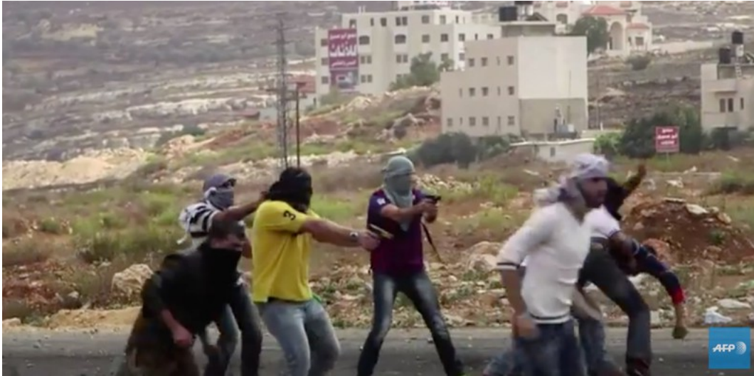
Still from AFP video shows Israeli agents who moments before were posing as demonstrators pull guns on Palestinians.

This video shows one of the undercover men firing a pistol at point blank range into the leg of a Palestinian who is on the ground and being assaulted by several men. The recoil from the weapon is visible and the sound of the gunshot can be heard in the video. The uniformed Israeli soldiers and their plain clothes accomplices continue brutally kicking and beating the victim and then drag him away. The victim makes several attempts to stand up, but his leg appears to buckle. What look like bloodstains can also be seen on his jeans.