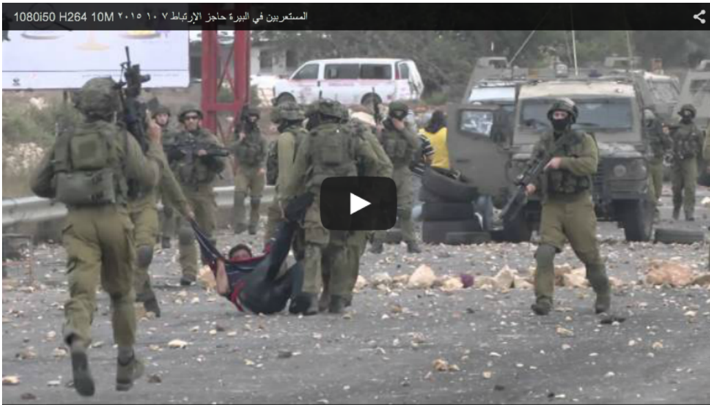
The still image captures the moment.

This video shows one of the undercover men firing a pistol at point blank range into the leg of a Palestinian who is on the ground and being assaulted by several men. The recoil from the weapon is visible and the sound of the gunshot can be heard in the video. The uniformed Israeli soldiers and their plain clothes accomplices continue brutally kicking and beating the victim and then drag him away. The victim makes several attempts to stand up, but his leg appears to buckle. What look like bloodstains can also be seen on his jeans.