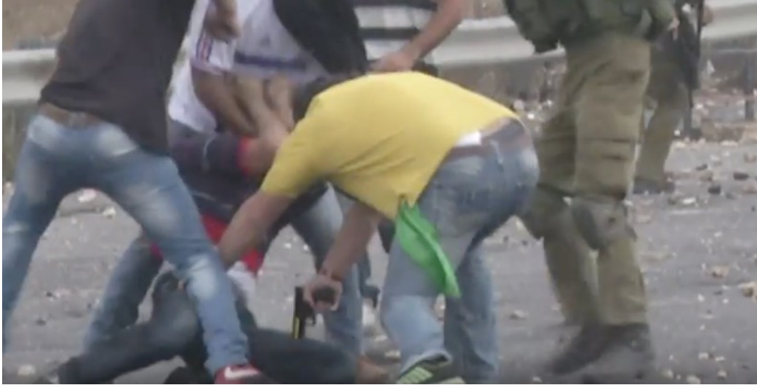
A still image shows the moment an Israeli undercover agent fires a pistol into the leg of a Palestinian at point blank range.

Ma'an News Agency reported ( http://www.maannnews.com/Content.aspx?id=768064 ) that two youths were shot, beaten and detained by Israelis in the incident and another was beaten and detained. Palestinian medical personnel have not been granted access to them.