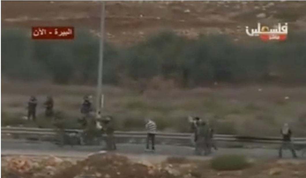
A still from another video shows the same man in a striped shirt cooperating with Israeli soldiers.