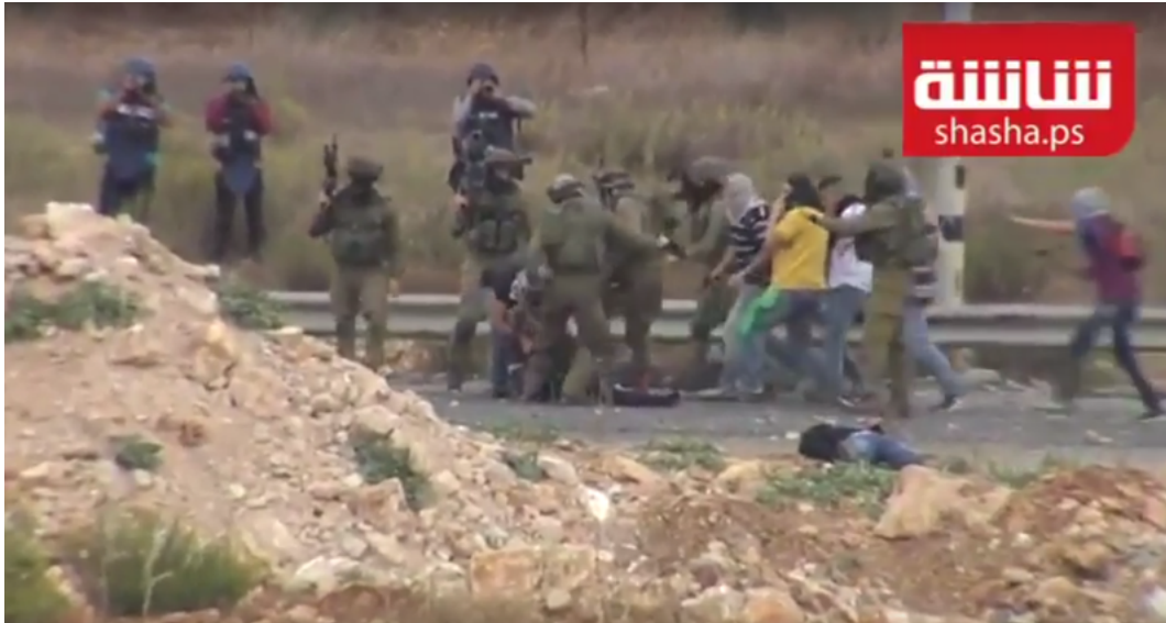
Video still shows an undercover Israeli agent with a striped shirt who appears armed.

At least one other Israeli agent appears in the Wattan TV video with a striped shirt, though with light pants. Could it be that striped shirts are used as a way for Israeli soldiers to easily tell who is on their side?